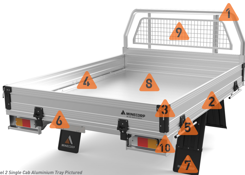
Level 2 Single Cab Aluminium Tray Pictured