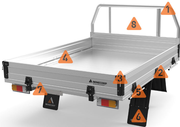
Level 1 Single Cab Aluminium Tray Pictured