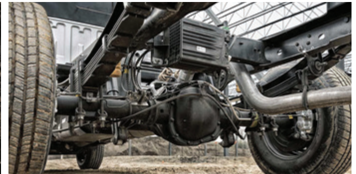
Rugged axles, chassis, and driveline components

Contact RMA Automotive for more information or a quotation.