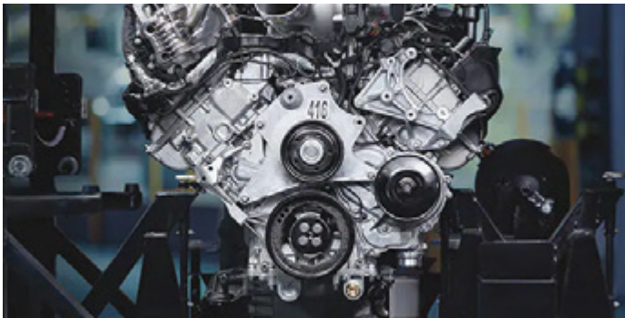
6.7L 4 Valve OHV Power Stroke® V8 Turbo Diesel B20 with Manual Push-Button Engine-Exhaust Braking

RHD conversion available for F Series 250, 350, 450 and 550.