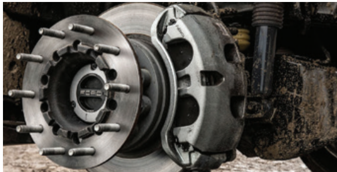
Heavy duty brakes